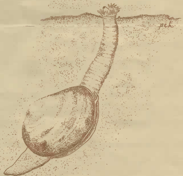
Soft-shelled Clam [ Mya arenaria ]

Belle Isle Inlet contains over 8,000 bushels of legal size soft-shelled clams, according to a 1972 inventory by the Massachusetts Division of Marine Fisheries. The current wholesale market value of these clams exceeds